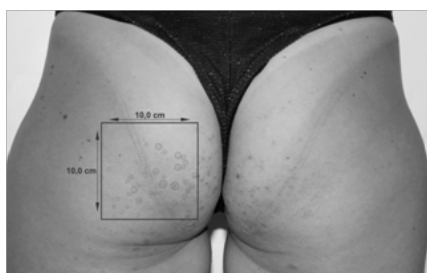
Figure 2 Area to be treated and selection of lesions.